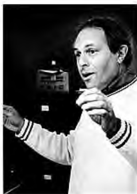
Jacob Druckman