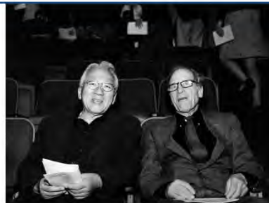
Joji Yuasa and Lukas Foss, 2000