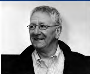
Bernard Rands, 2002

Alvin Lucier Miller Puckette Steve Reich Roger Reynolds Christopher Rouse Gunther Schuller Harvey Sollberger Jeffrey Stadelman Morton Subotnick Augusta Read Thomas Nils Vigeland Charles Wuorinen