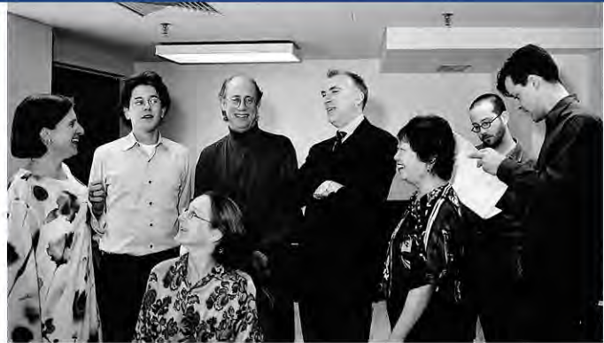
New York New Music Ensemble, 2003