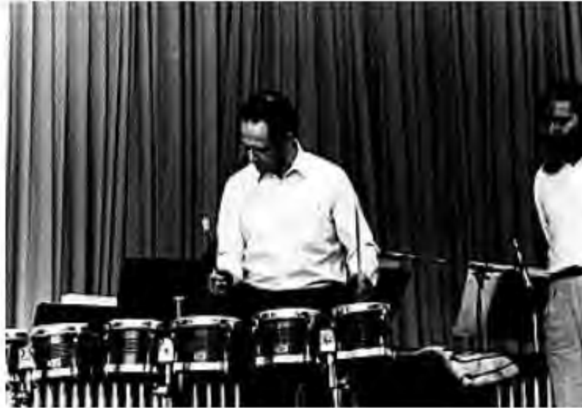
Steve Reich performing, probably at June in Buffalo 1987

On 1 June 2010 Pulitzer-prize winning composer Steve Reich will be awarded an honorary doctorate in music from the University at Buffalo. Steve Reich's association with June in Buffalo dates to 1976, the second June in Buffalo under Morton Feldman's direction. He returned again for the 1980 June in Buffalo.