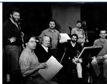
Meridian Arts Ensemble with composer Philippe Manoury, 2002