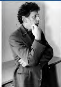
Philip Glass, 2000