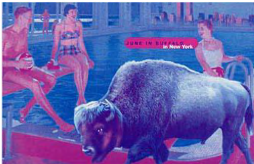
Flyer for a June in Buffalo performance at the Goethe-Institut in New York City June 11, 1998

It's tempting to call June in Buffalo a festival but that wouldn't be quite right, because most festivals aim to attract a large listening public to concerts, most often with some defining slant or unifying bias. June in Buffalo, on the other hand, welcomes anyone who wants to come and listen to its largely free series of concerts. But it exists primarily to serve younger composers on the way up.