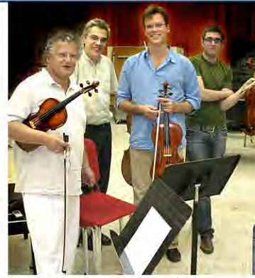
Arditti Quartet, 2007