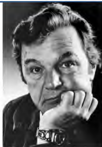
Donald Erb

Charles Wuorinen and Roger Reynolds have both been frequent guests at June in Buffalo as faculty composers. There have been twenty-three works by Wuorinen and fourteen works by Reynolds performed at June in Buffalo.