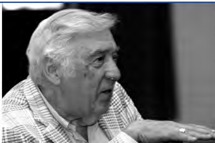
Gunter Schuller, 2006