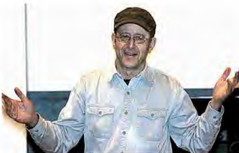
Steve Reich during lecture June in Buffalo 2007