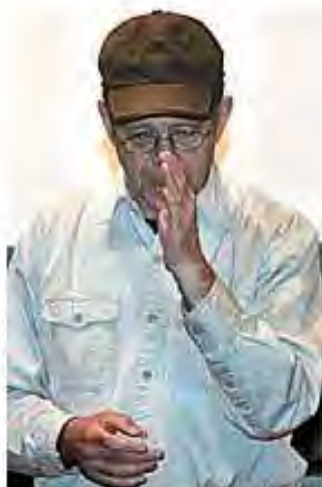
Steve Reich during lecture June in Buffalo 2007