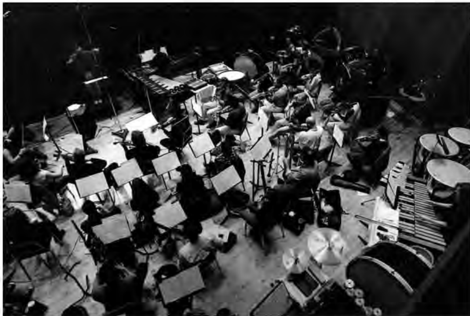
Harvey Sollberger conducting the June in Buffalo Chamber Orchestra, 2000