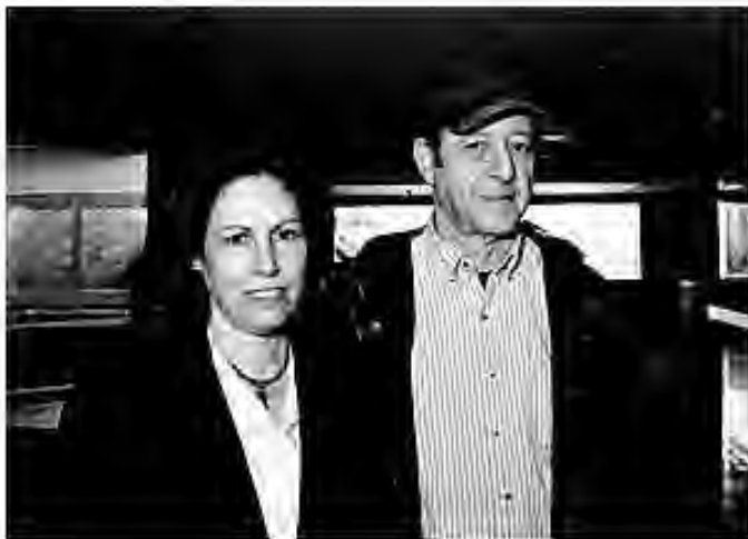
Beryl Korot and Steve Reich at June in Buffalo 2003