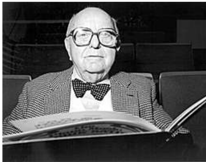
Composer Virgil Thomson