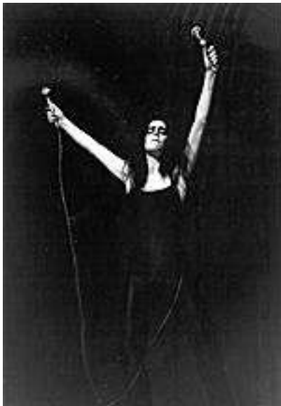
Performer Diamanda Galas