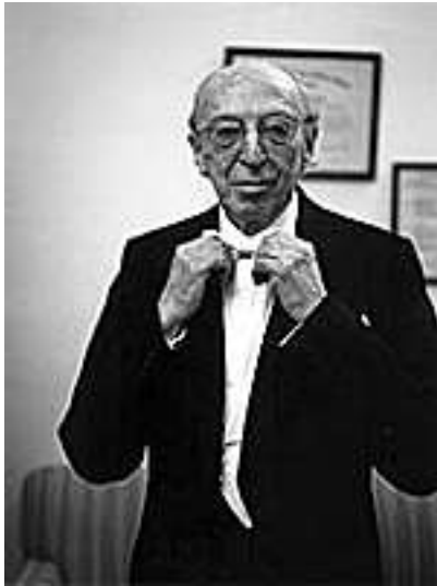
Composer Aaron Copland