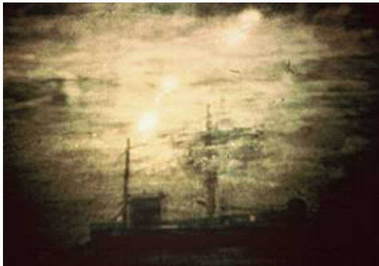
One of two selections in the vertical cases from unnumbered series, Anima Animus