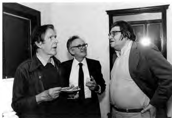
Photograph of John Cage, Lejaren Hiller, and Morton Feldman, ca. 1980.

Program for 1980 performance of HPSCHD at Albright-Knox Art Gallery.