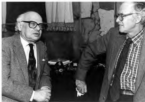
Photograph of Milton Babbitt and Lejaren Hiller, ca. 1980

It was thorough, I can tell you, and he was fanatic about getting it right. I can still, I think, write strict counterpoint in my sleep practically, and I give all due credit to Milton. He loved that kind of abstraction. And it's interesting that this, I think, appealed to him almost as much, in terms of teaching, as say teaching the material he's famous for now, set theory and all that sort of thing. There are many similarities, if you think about it. And so I spent a whole year in that. We went through all the species, if I remember right, up to four parts. Then I moved on to work with Roger Sessions as a composing student."