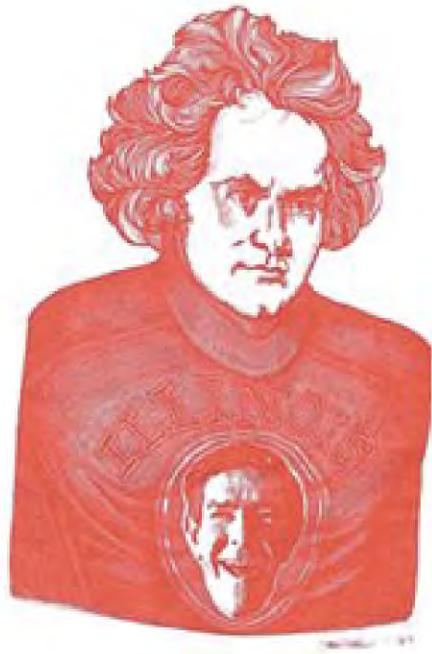
Silk-screened Tee-shirt courtesy of David Eisenman. Reproduction of design used at 1969 premiere of HPSCHD .