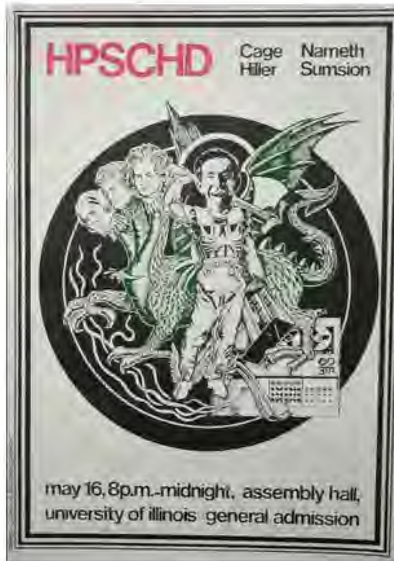
HPSCHD poster no. 1